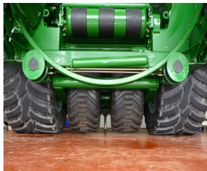
4-Wheel Chassis fitted to McHale Fusion 3