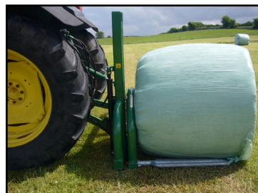
The Ducks Foot Bale Lifter handles without damage to film