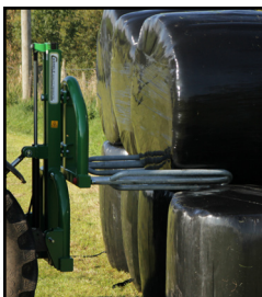
Easily stacks two high