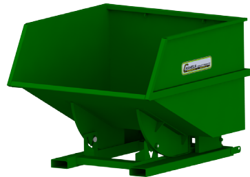
5' model with Side Extensions