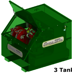
3 Tank Lube Skid

The Cashels range of Bunded Lube Skids & Trailers has been developed for servicing mobile equipment in the construction, mining and various other on-site environments. They are also used by companies who service large installations of compressors and standby generators in data centres, treatment plants, communication towers and generator stations etc.